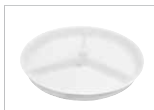
Drying agent tray for VDR