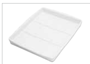
Drying agent tray for VDC