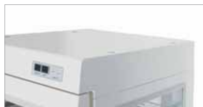
Foot alignment grooves for stacking (for DCL/DC-11, 21S)