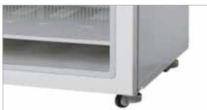
Casters (for DCL/DC-41)