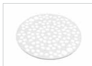
Perforated sample tray for VDR