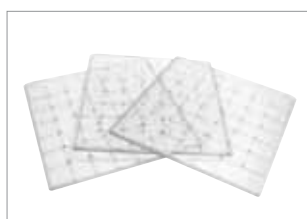
Perforated sample tray for VDC